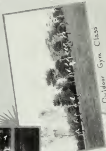
Outdoor Gym Class